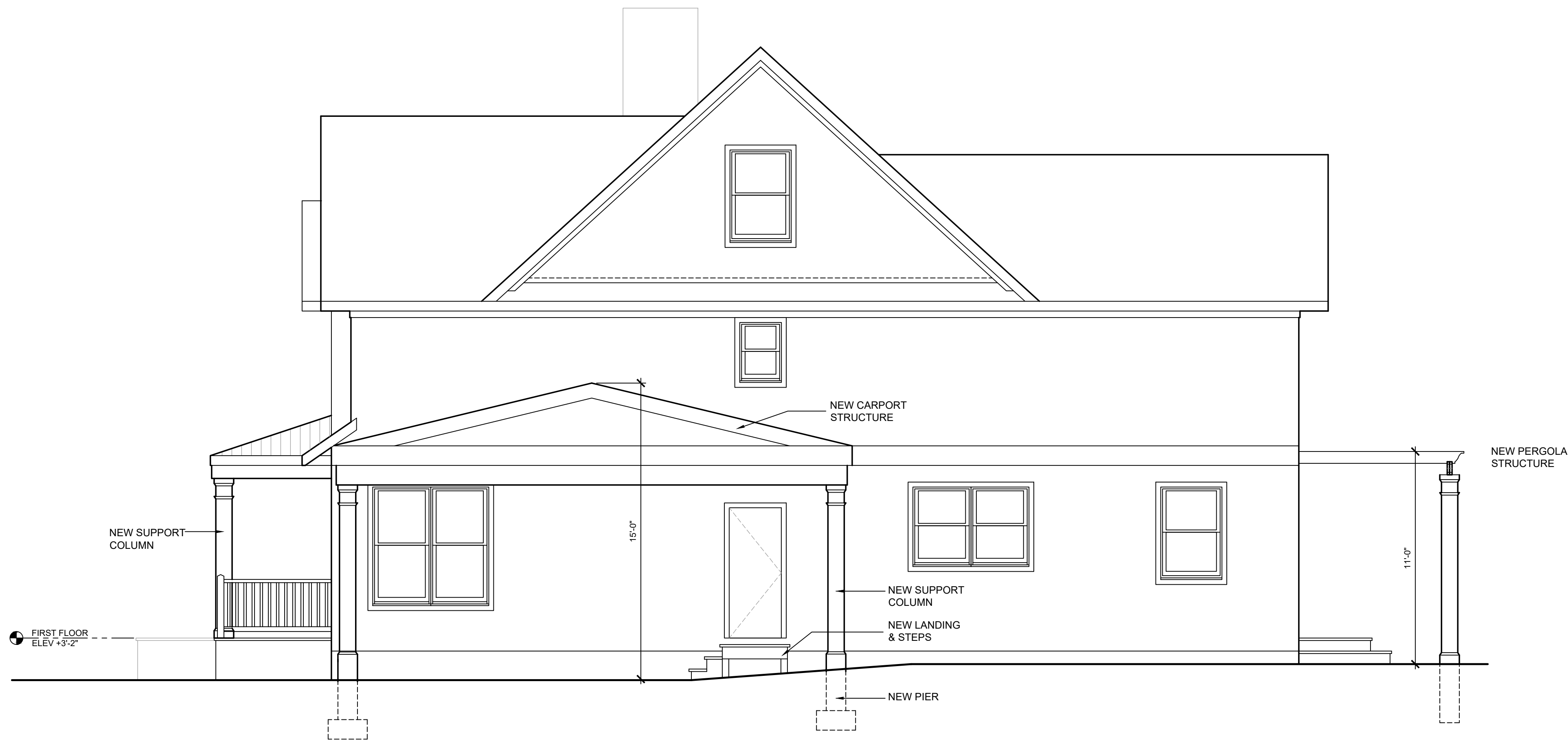
SIDE (WEST) ELEVATION