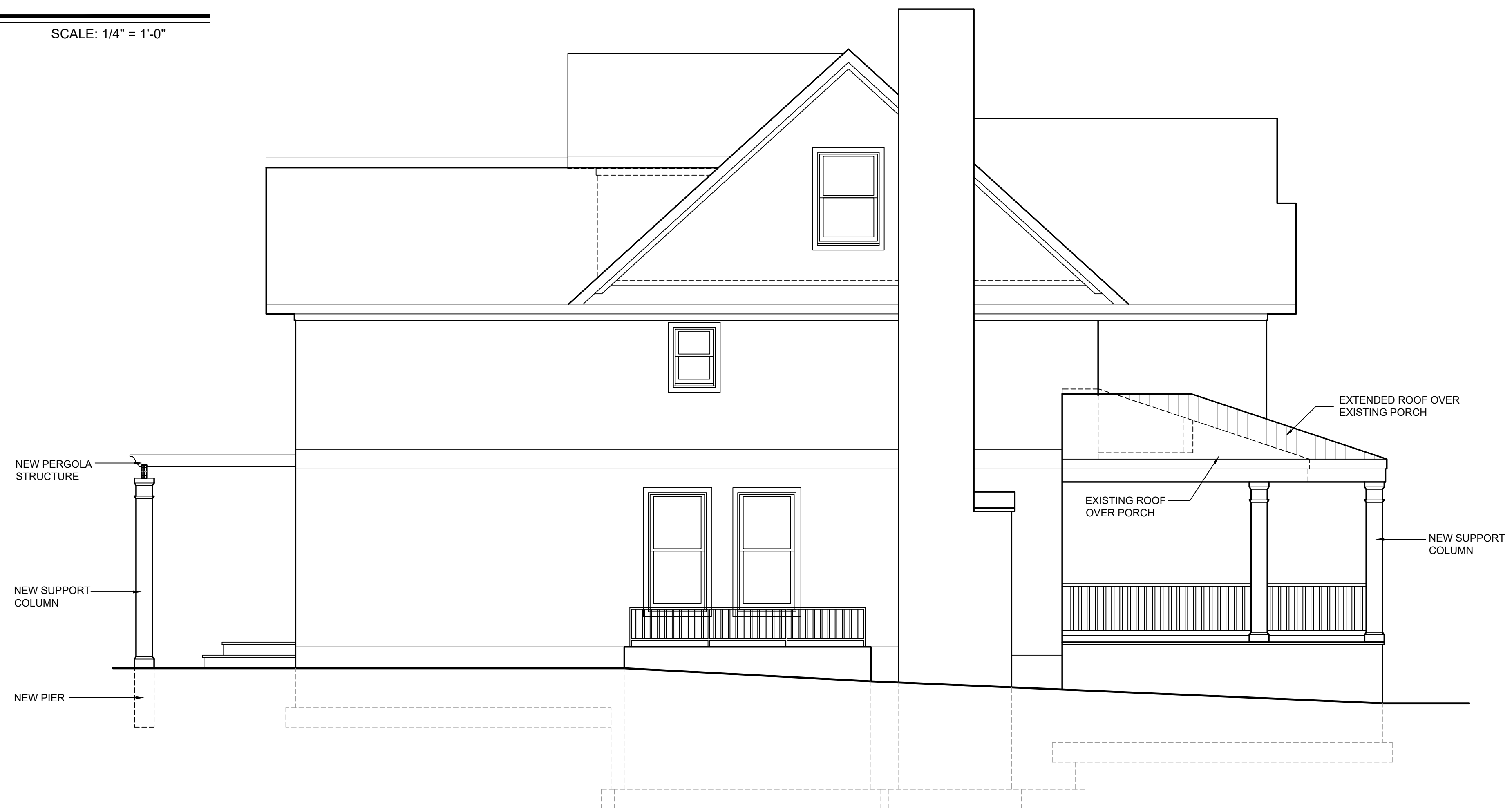
SIDE (EAST) ELEVATION