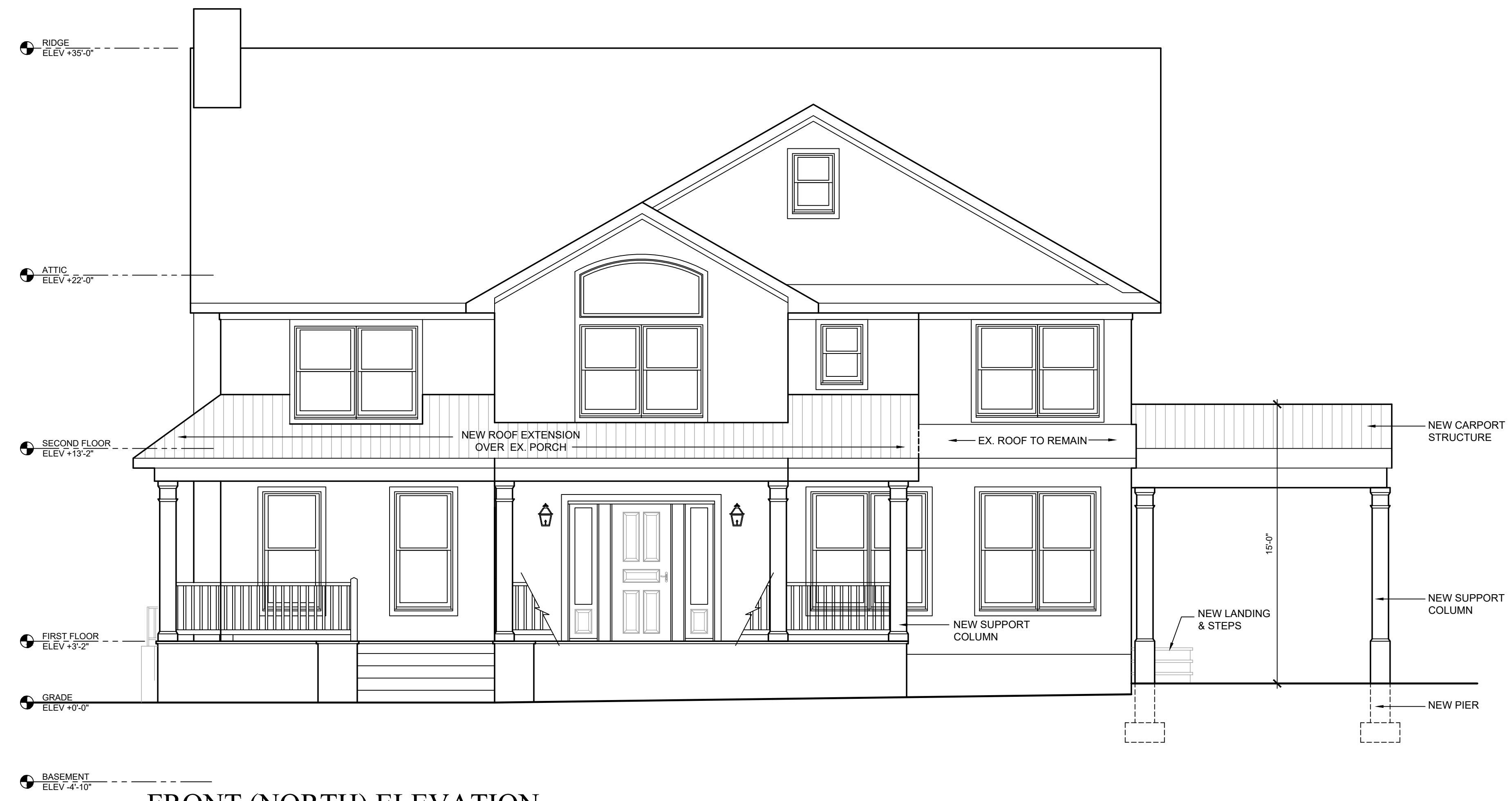
FRONT (NORTH) ELEVATION