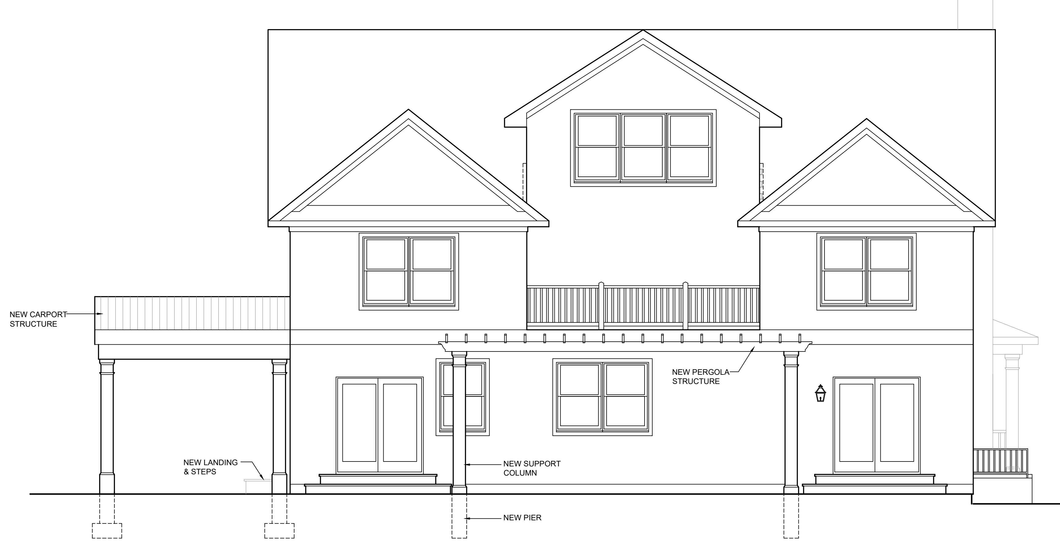
REAR (SOUTH) ELEVATION